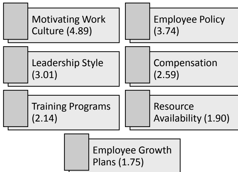
Fig. 2- Potential Factors Increasing Employee Retention

6.1 In order to achieve first research objective factors are identified through factor analysis and rank them on the basis of their collective Eigen values. Seven effective factors are identified according to the responses which are-